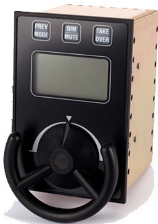
FOLLOW-UP MINI WHEEL & DISPLAY