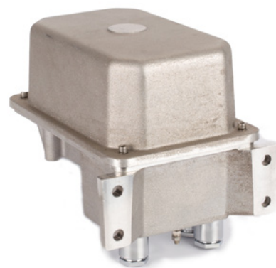
RUDDER ANGLE FEEDBACK UNIT