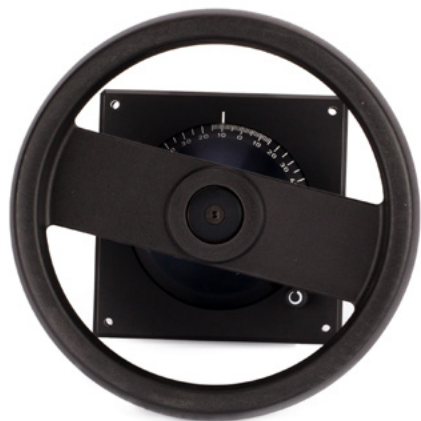
FOLLOW-UP HAND WHEEL

As with all Sperry Marine systems and products, all your NAVIGUIDE 4000 components will be supported by one of the world's most extensive worldwide service networks, with help available around the clock, 24 hours a day, 365 days a year. Our global service network provides prompt shipboard maintenance and repair services in every major seaport in the world. We also offer comprehensive maintenance contracts, as well as support for all products for at least ten years after any is discontinued, so providing continuing peace of mind to all our customers.