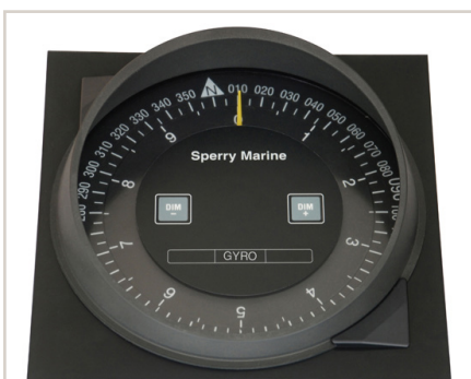
Console Repeater Compass 360°/10°