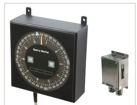
Bulkhead Repeater Compass 360°/10°