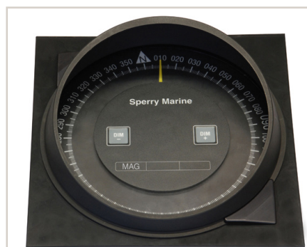
Magnetic Heading Console Repeater 360°