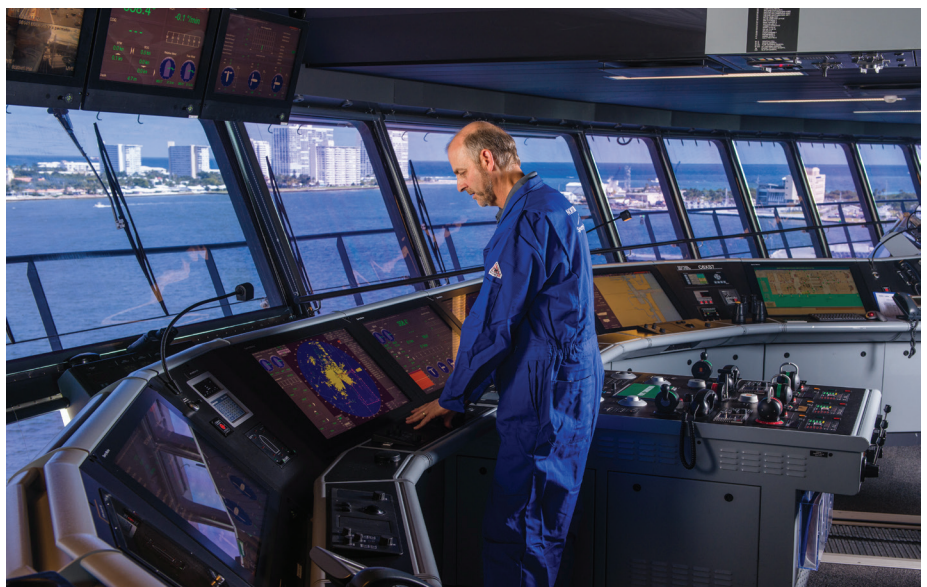
Worldwide service with skilled and trained Marine Service Engineers

We can offer proven retrofit solutions for all Northrop Grumman Sperry Marine products, as well as those of virtually any other manufacturer. With many years of retrofit experience, and our expertise as a manufacturer, we have the essential skills and equipment to integrate technologies of different generations and systems.